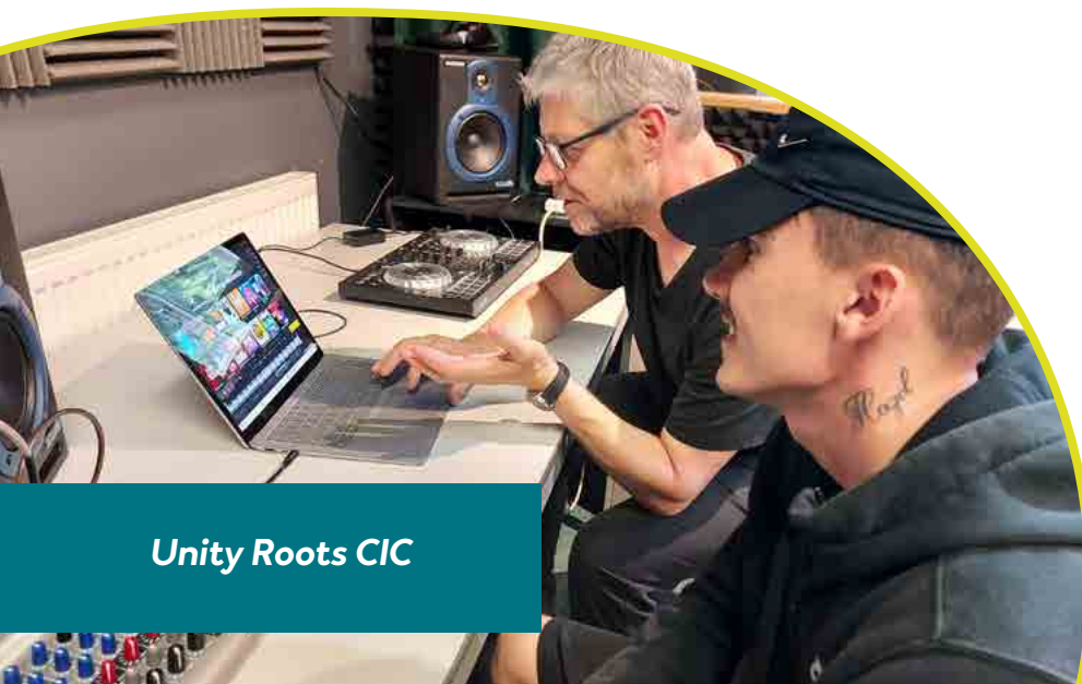
Unity Roots CIC

People often assume that Kent is a wealthy county, but it is also a county of disparities, with some areas and communities suffering great deprivation. More than any other organisation in Kent, Kent Community Foundation really is aware of these social needs, and how and where its funds will have the greatest impact.'