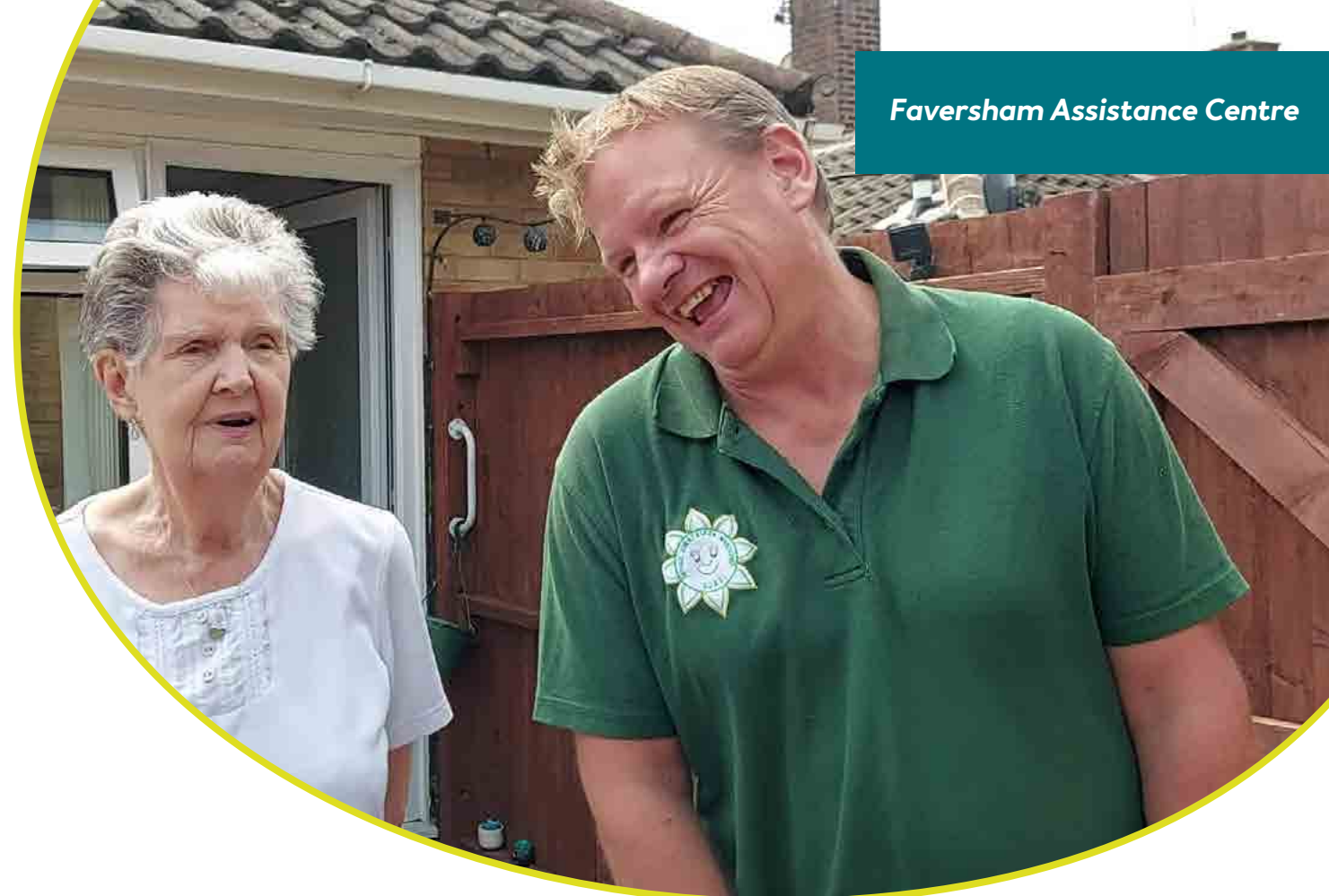
Faversham Assistance Centre